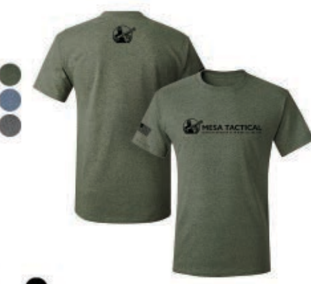
Mesa Tactical Short Sleeve Tee Logo3, Olive Heather

Mesa Tactical Long Sleeve Tee Logo4, Athletic Heather