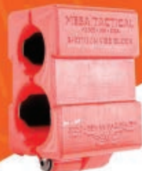
Mesatac Shotgun Vise Blocks