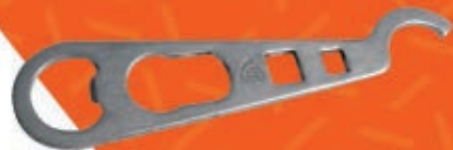
Mesatac AR-15 Armorer and Bartender's Tool