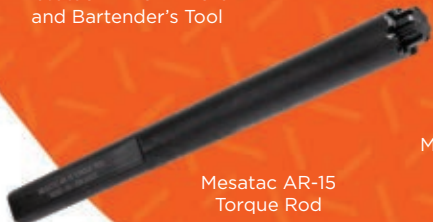
Mesatac AR-15 Torque Rod